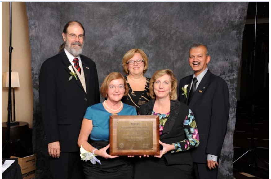
Georgia Tech Research Institute, 2013 Recipient of both the Region 3 and the EAB Employer Professional Development Awards