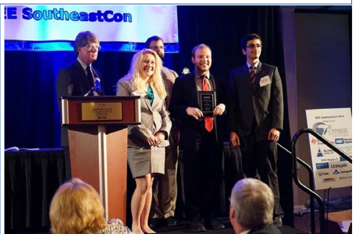
A few of our many student award winners