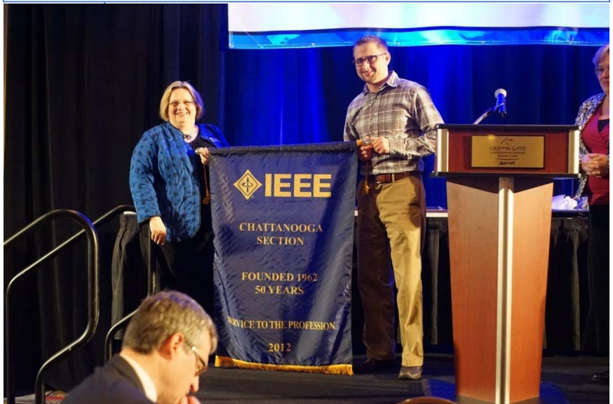
Chattanooga Section, recognized with a banner for their 50th anniversary