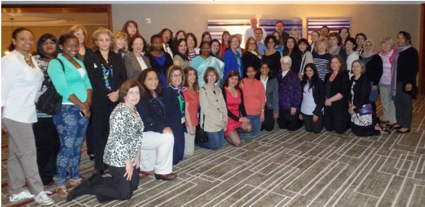
The IEEE Women In Engineering Committee attendees

Preliminary plans are to hold the second annual WIE-ILC in 2015 in San Francisco. Please stay tuned and consider allocating funds to support your section AG chair's attendance at this inspiring conference next year.